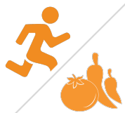
Diet & Exercise